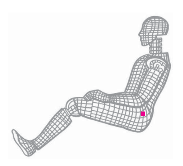
Fig. 1: Dummy application, location iliac wing

Type M57611A... is designed to measure sideward forces in the pelvis iliac wing of the crash test dummy SidIIs.