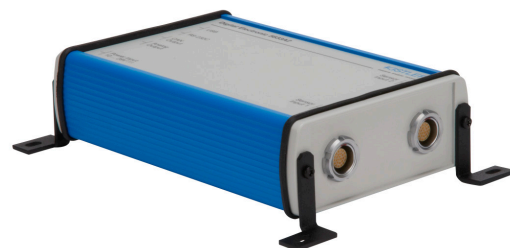
Fig. 1: Hub connection end