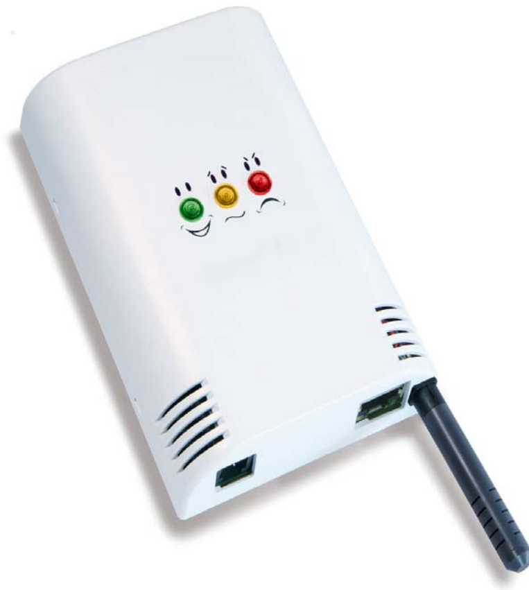
Fig. 1: AQ-CLIMATE CONTROL sensor system.

A two-beam infrared sensor (NDIR) is mounted on a sensor holder inside the plastic housing and above a diffusion opening to measure the carbon dioxide concentration. The sensors for the relative humidity (15 to 95 % RH) and temperature (0 to 50° C) are located in a sensing element made of PVC protruding from the bottom of the housing. The microprocessor for processing data, the digital outputs and an actuator (relay contact) are additionally integrated in the housing (see Fig. 1).